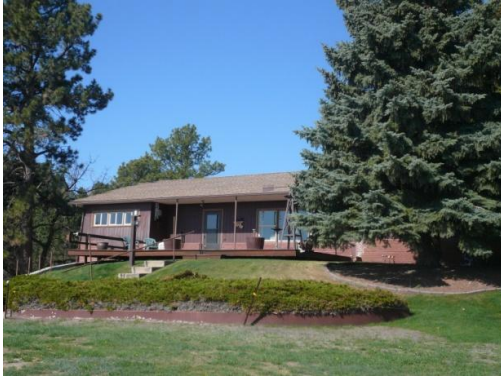
The main home