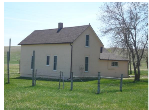
House #2 from the NW