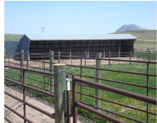
Sample of steel pens & alleys