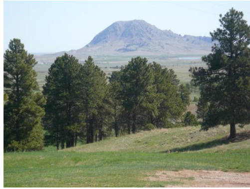
View from the deck