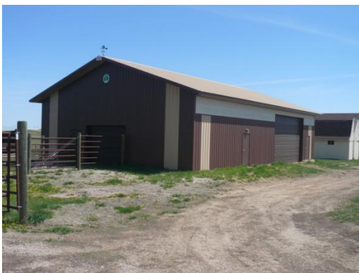
Near new 42'x 64' building