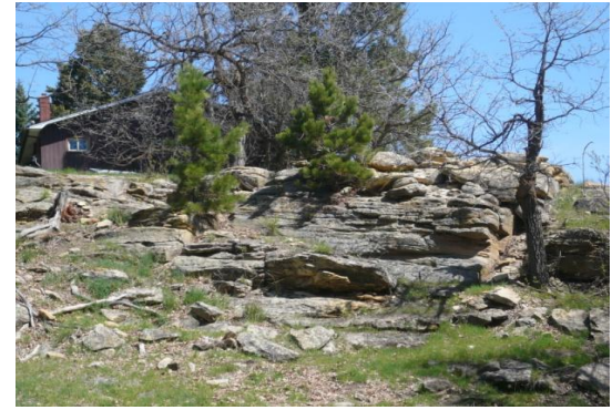
Rock formation near main house