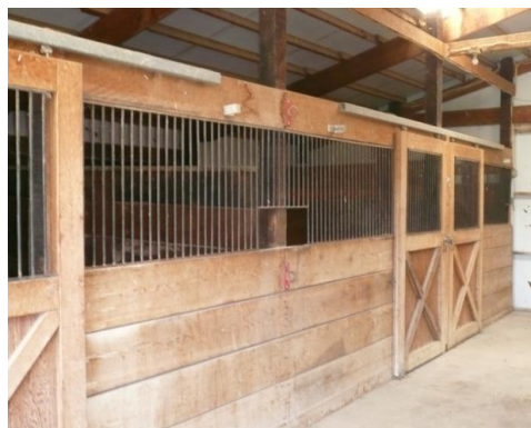
Box stalls in the horse barn