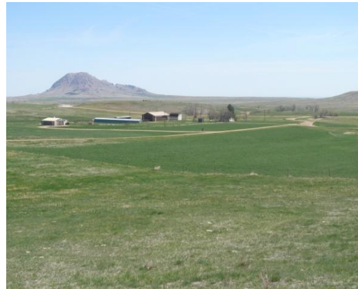
View of buildings & home # 2