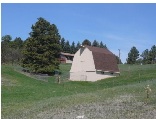
One of 2 old-style solid barns