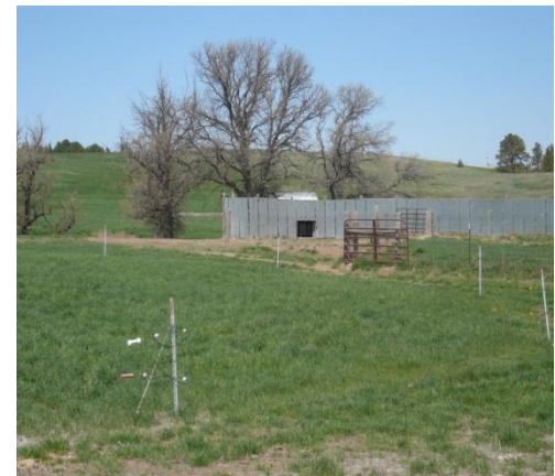
Man-made windbreak shelter

The Jim Roth Ranch, 199 acres , has it all, location, a view of one of the U. S's natural marvels; just two miles from downtown Sturgis; a combination of both Black Hills and prairie county; a fine main home and useful second dwelling; functionality in the form of very good outbuilding (both late built and older) and excellent pens and livestock handling facilities; a neighborhood that has some built in security that it will remain pristine and uncluttered. And a general community that offers resources of a wide variety.